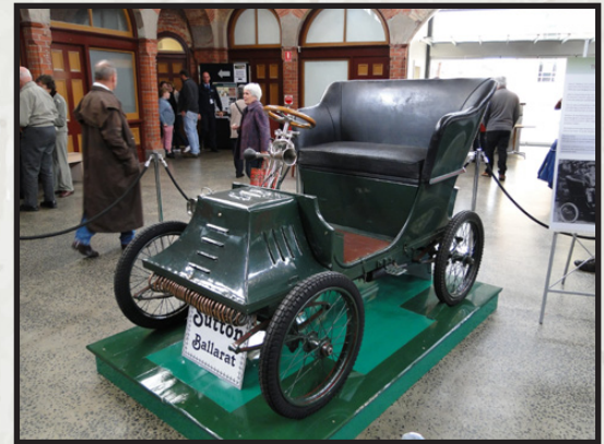
A Sutton Voiturette Pedal Car, built in Ballarat, Victoria, Australia, in 1900